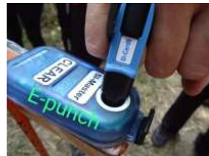
Fig 2: Punching using an Si-Card