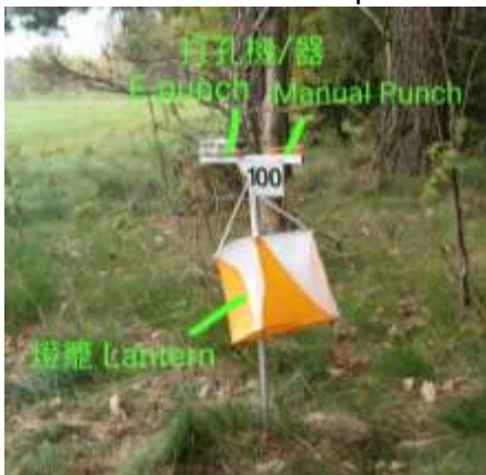
Fig 1: A control consists of a lantern/marker, an electronic punch, and a manual punch